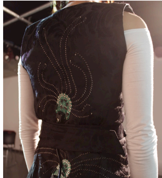
Figure 3 The back zone and the belt zone. The vibrotactile elements lie underneath the area between two connector endings emanating from each of the central boards.

From the the start, therefore, we aimed at integrating the technological elements of the suit (motherboards, vibrotactile elements, cables etc.) into the textile design – for example, all vibrotactile elements were sewn into the suit, connections inside the suit were stitched – and look like embroidery.