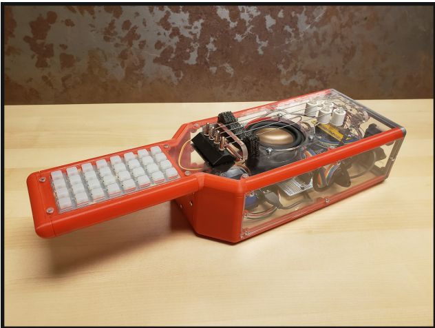
Figure 4: The Stringbox.

While the Keybox is finished and playable at present, we continue to make incremental enhancements. In its current form it lacks direct sound output, but an updated version of the enclosure will include onboard amplification, which is a feature of the other instruments. Additionally, we have installed an IMU that will map movement of the instrument to user-selectable sound parameters.